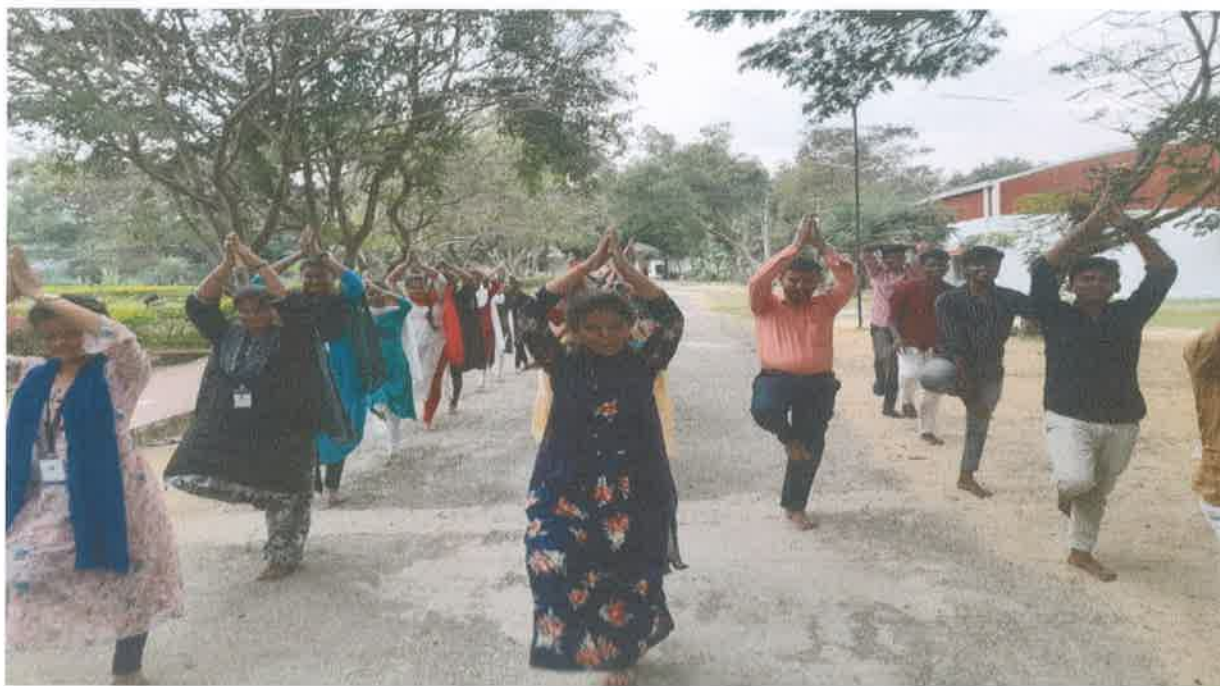
Faculty Demonstrating the Activities

The Internal Resource Person advised the students the following life skills through physical fitness team work, goal setting, time management, emotional skills, interpersonal communication, goal skills, leadership problem solving and the decision making. The components of skill related physical fitness help the students to perform well in sports and other activities. The attributes of physical fitness make students a better manager, employee, entrepreneur, partner, friend and family. In the program the resource person clearly explained the following observations a student can find the benefits of physical activity to the body and mind.