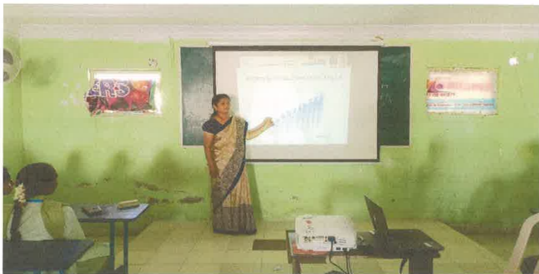
Resource person demonstrating the skill Activity

The diagnosis and procedure codes are taken from medical record documentation, such as transcription of physician's notes, laboratory and radiologic results etc. Generic Data Analysis professionals help ensure the codes are applied correctly in the medical billing process.