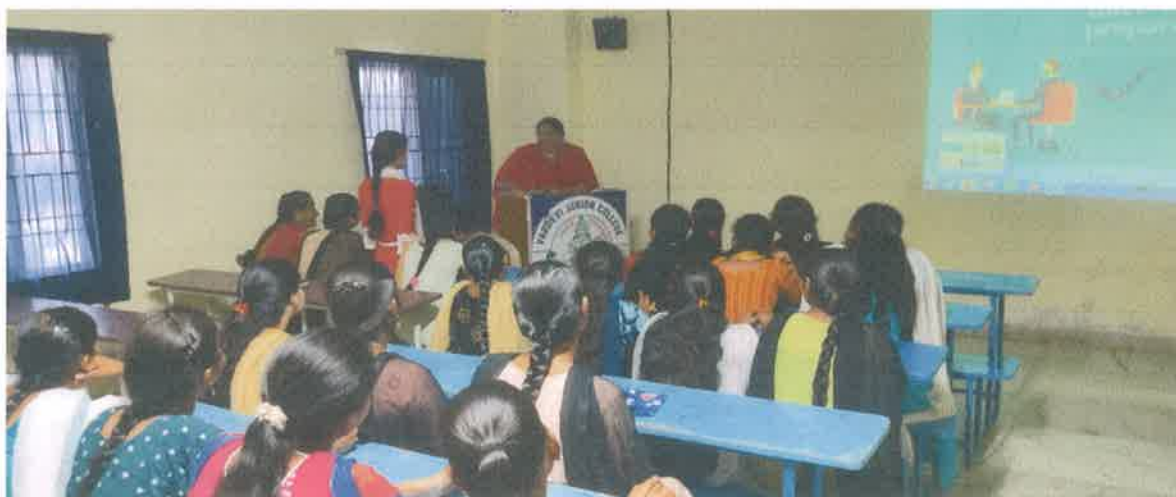
Soft skills Activity

Our Faculty divided the content into different modules. At first, she explained the students what the soft skills are, why it is important for the students to acquire and what kind of skills are, why it is important for the students to acquire and what kind of skills the employer expects from the candidates.