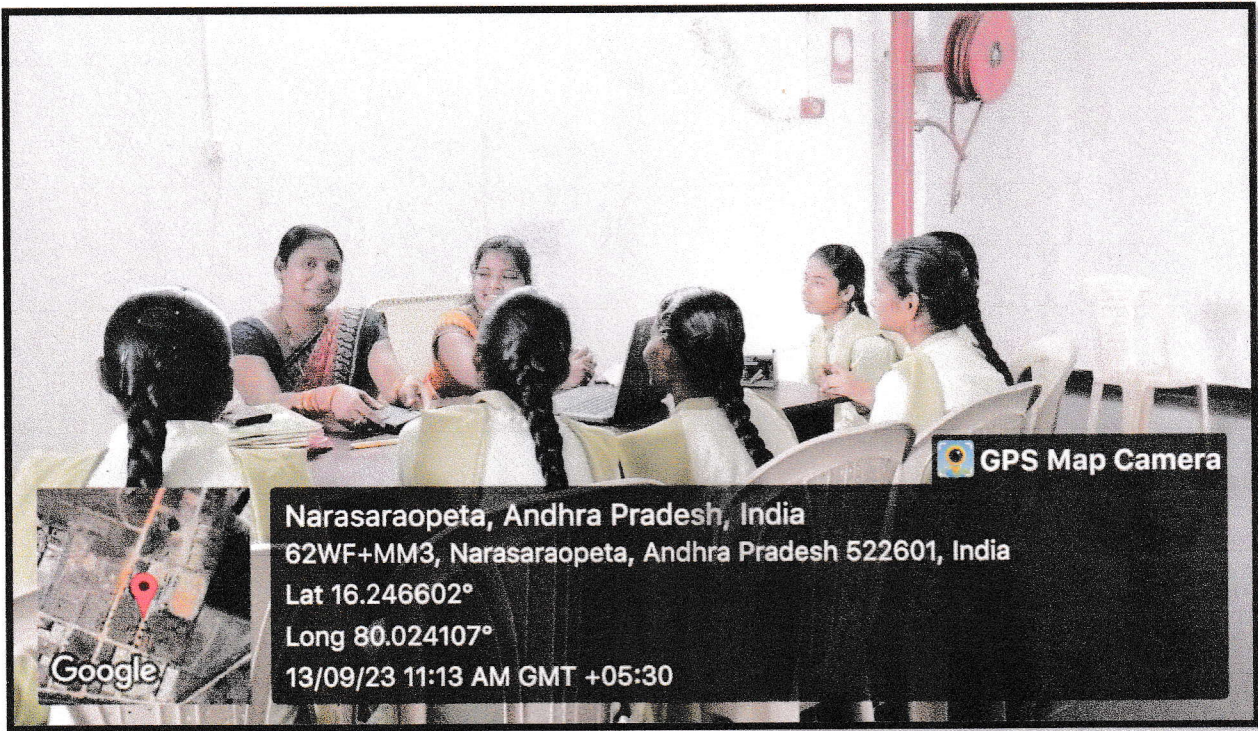
Fig I & II Counselling Sessions