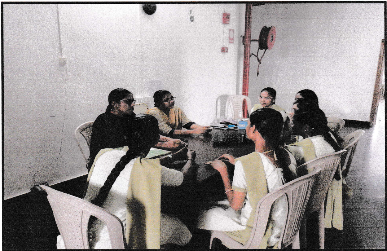
Fig: Counselling Sessions