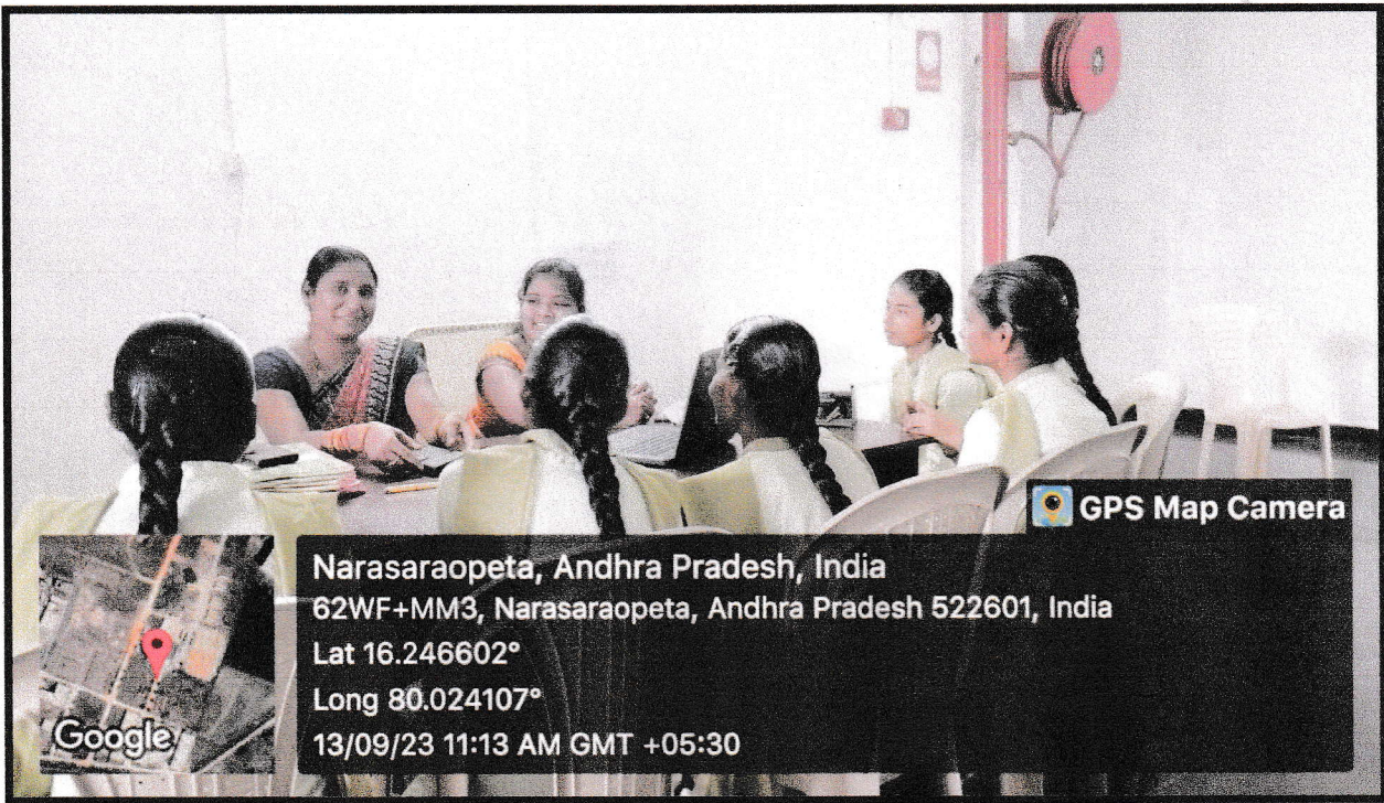
Fig: Counselling Sessions