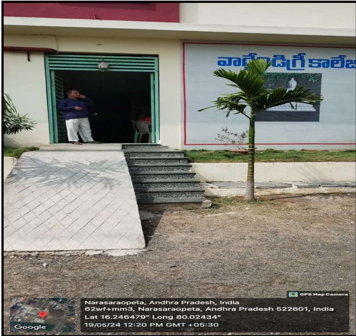
Fig: Disabled Friendly Pathways

C.O.A, I.I.A, M.I.E, F.I.V, APPROVED VALUER, C.ENG., WEALTH TAX, I.B.B.I.